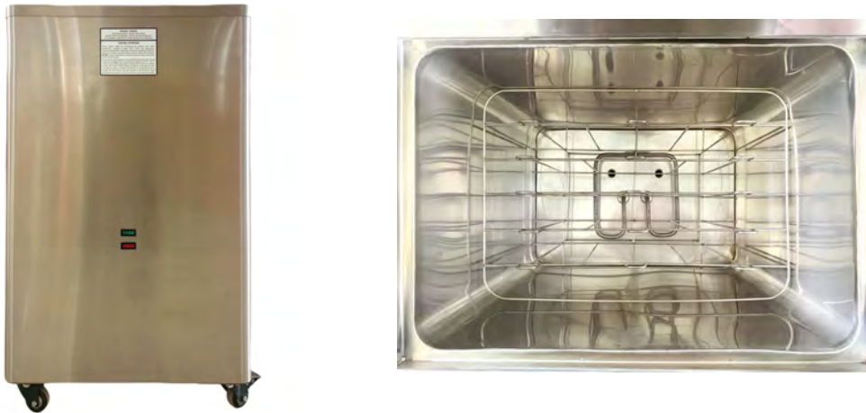
PROHEATX 049 Heating Unit and Inside View