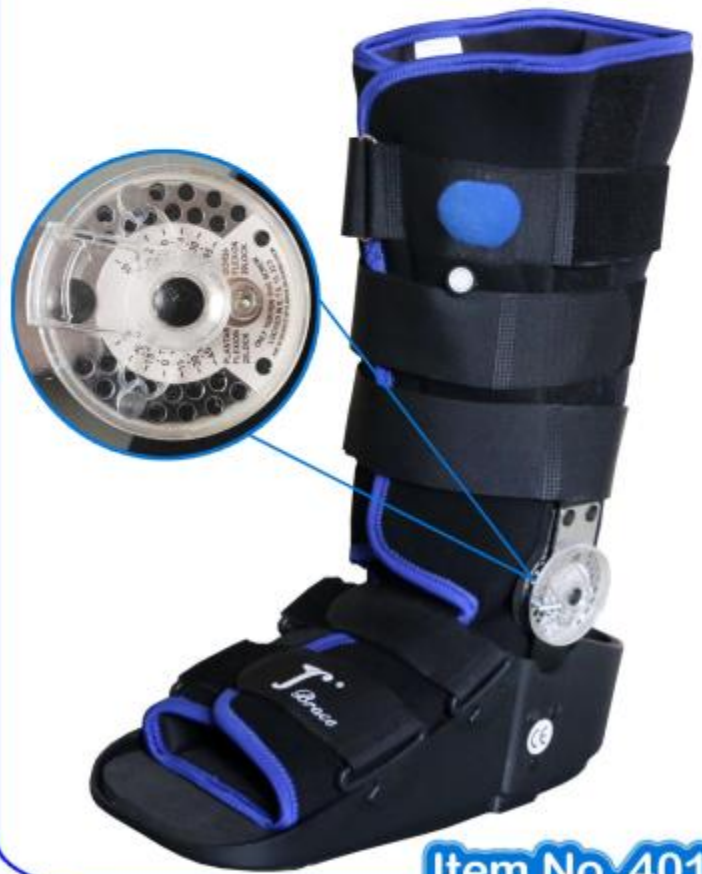
Item No. 4016