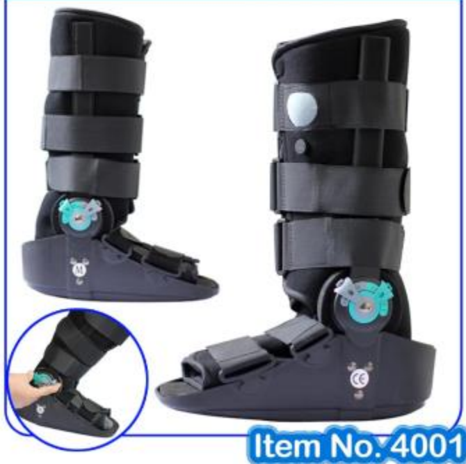
Item No. 4001